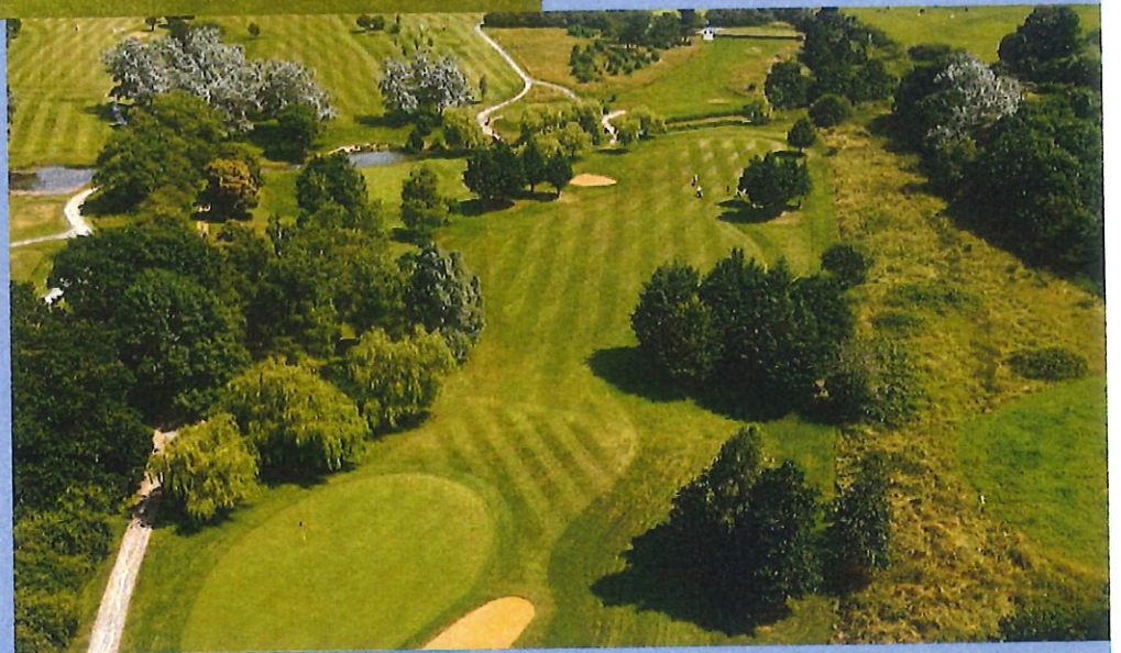
16 th Hole