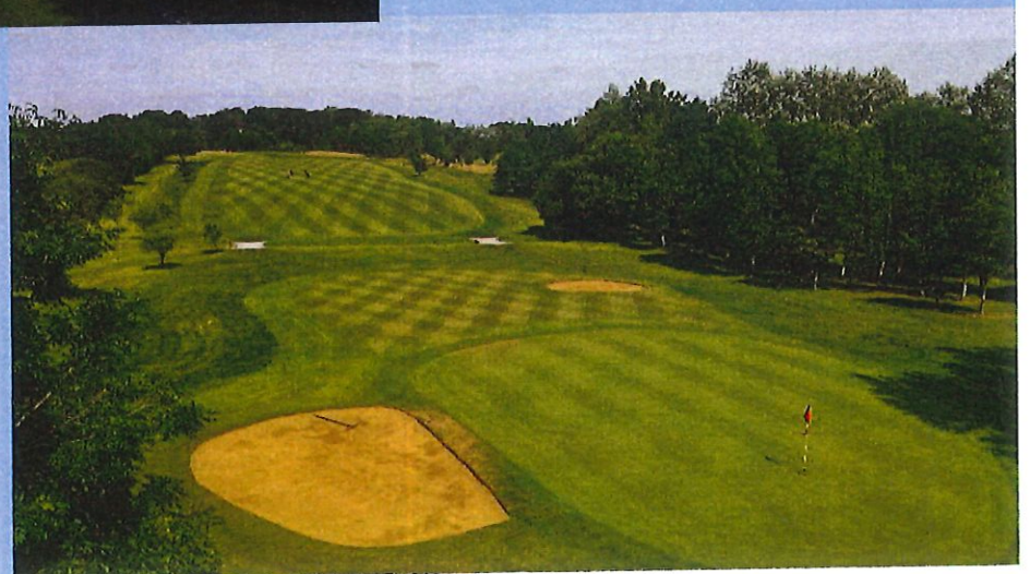
11 th Hole