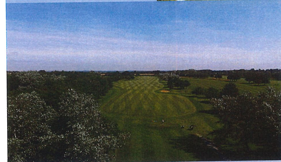
12 th Fairway