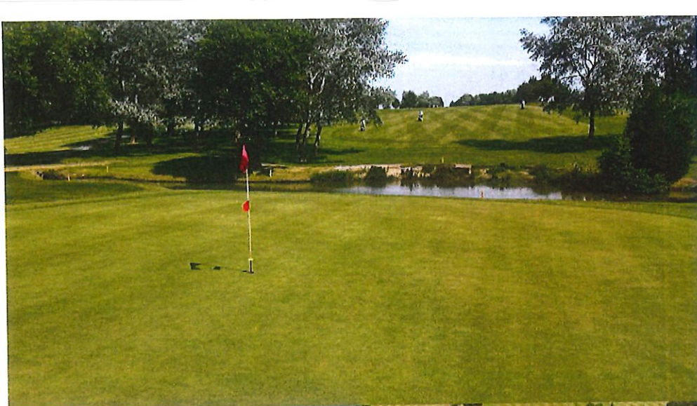
13 th Green